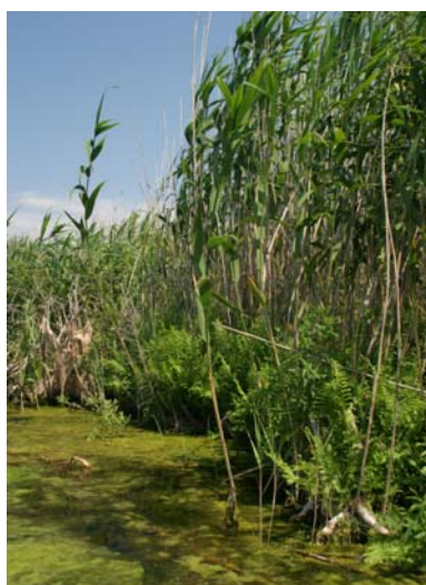
Fig. 9. Thelypteris palustris in Srebarna lake