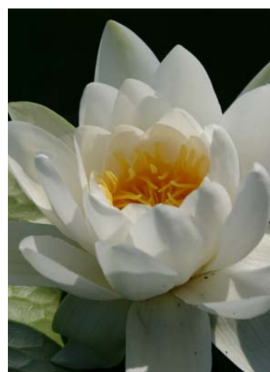
Fig. 10. Nymphaea alba in Srebarna lake