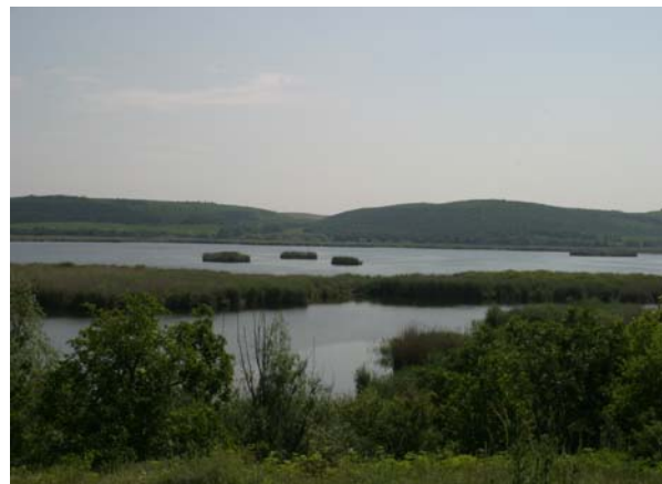
Fig. 2. Srebarna lake