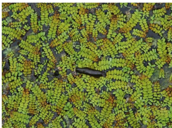
Fig. 8. Salvinia natans in Brashlen-Kalimok