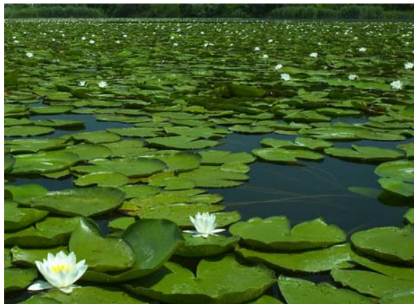
Fig. 3. Lake Malak Preslavets