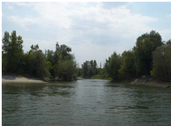
Fig. 1. Small river channel of Danube