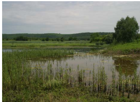
Fig. 4. Marsh Garvan