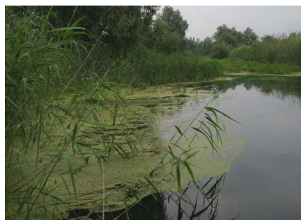
Fig. 5. Brashlen-Kalimok reservoirs