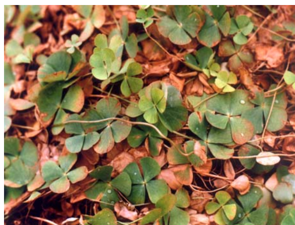
Fig. 6. Marsilea quadrifolia